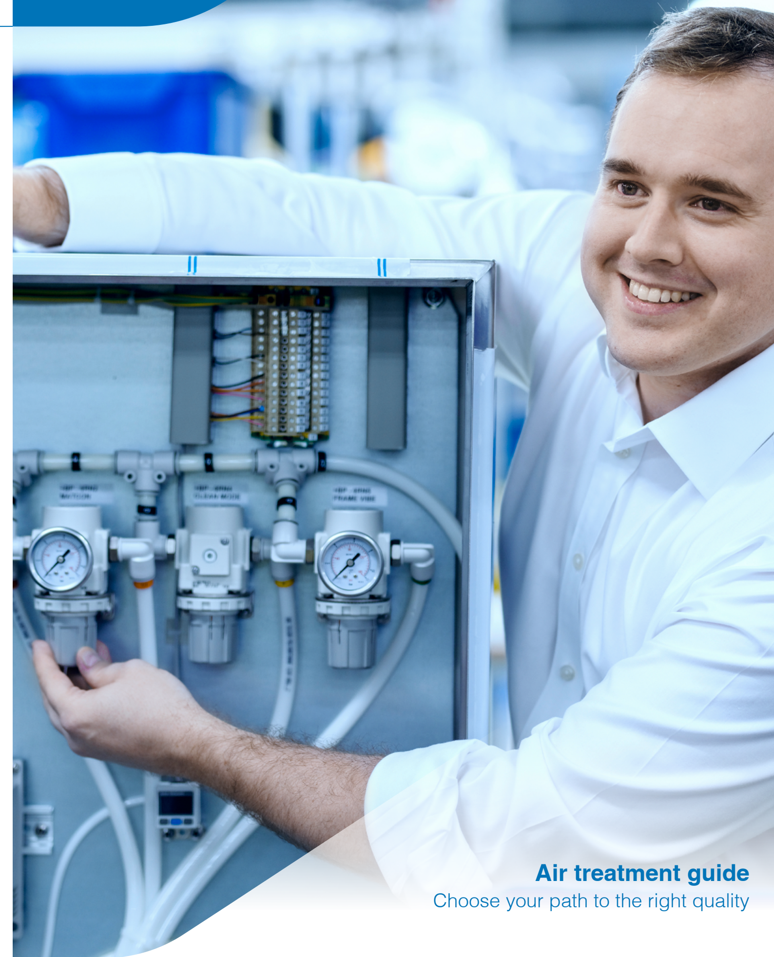
Air treatment guide Choose your path to the right quality

South Africa +27 10 900 1233 www.smcza.co.za zasales@smcza.co.za